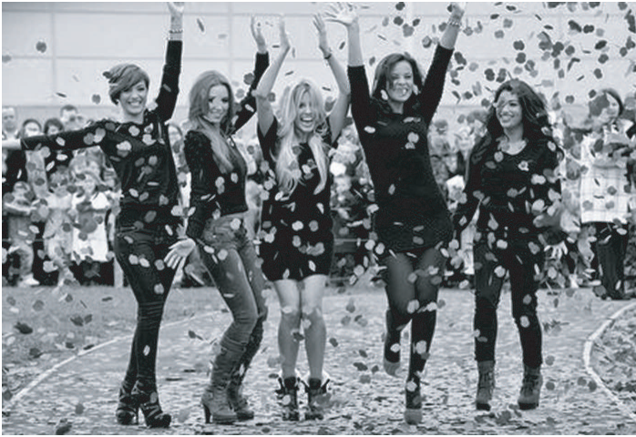
The Saturdays launch 2010's Poppy Appeal - see how happy and liberated they are! That's what Grandpa fought for!