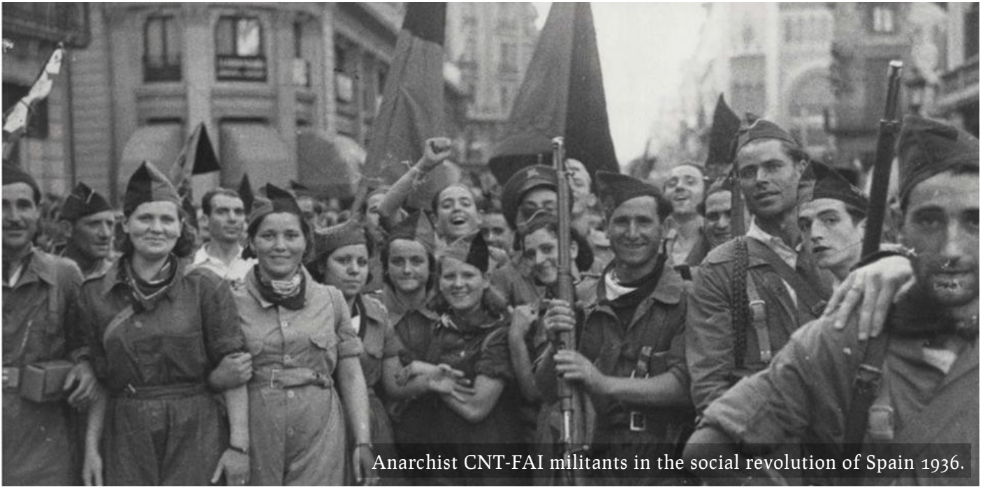
Anarchist CNT-FAI militants in the social revolution of Spain 1936.