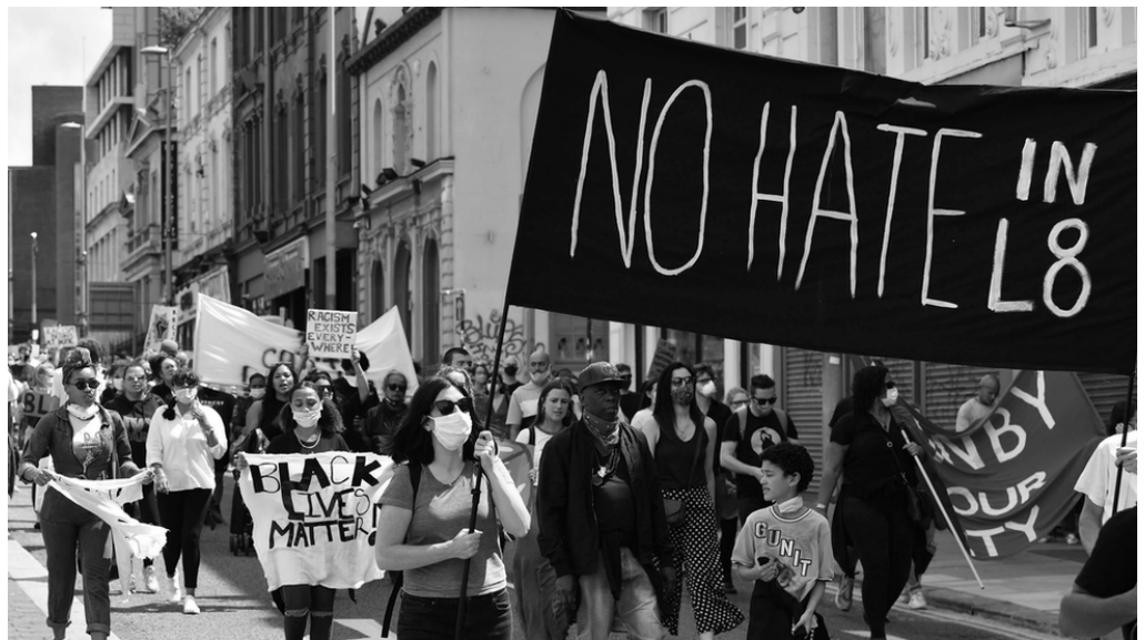
L8 Black Lives Matter demonstration, 13 th June 2020. See page 2 for article.

On a smaller scale members of SolFed organised with a local worker to reclaim stolen wages and also helped a student to gain a rent reduction from YPP letting agents, in both cases just under £700 was won. The simple threat of