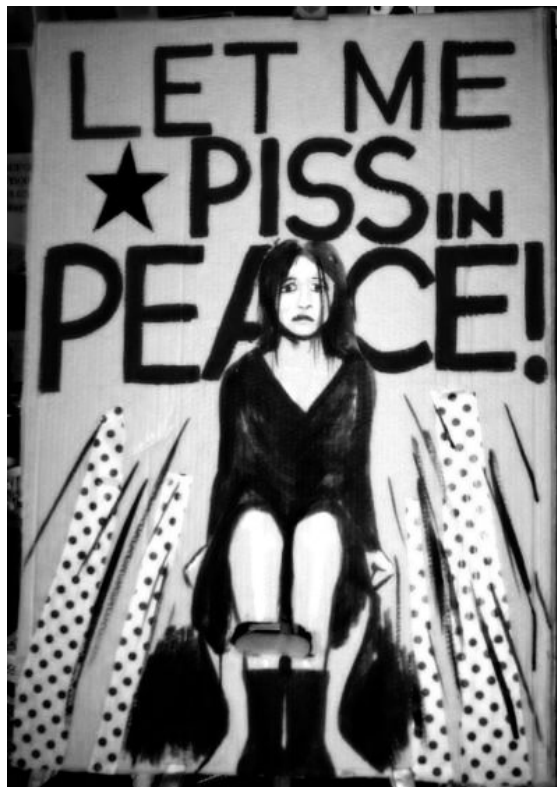
Placard from a picket in 2015 where Sheffield IWW managed to reinstate a transgender worker who was fired for going to the loo.

What these attacks really demonstrate is that promises of support from the mass media, politicians and corporations mean little to nothing as soon as being transphobic leads to a good story, a distraction from their latest scandal or a chance to earn some cash. Any legal gains we make can be reversed overnight.