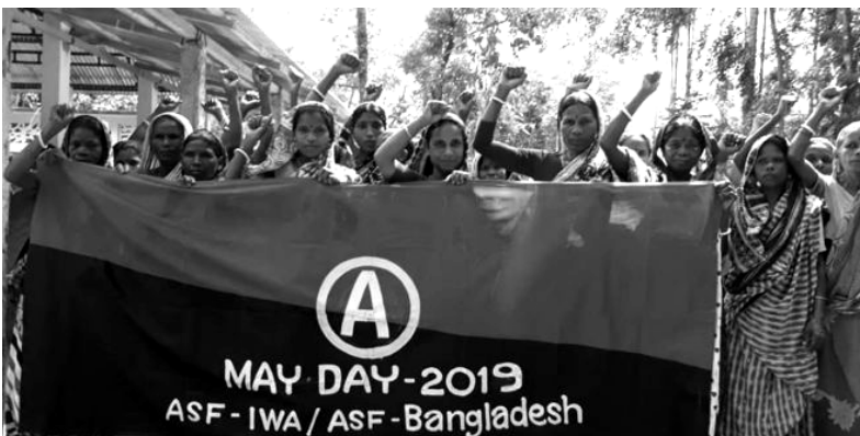
~ The Bangladesh Anarcho-Syndicalist Federation. ~

We don't expect all workers to agree with our anarchist politics, and many are already members of trade unions, often several in the same workplace. We don't want to create further division, nor recruit all workers into our union and exclude the others. In this situation, we can call for mass meetings in the workplace open to other workers regardless of union membership (or lack thereof), and argue for direct action from the