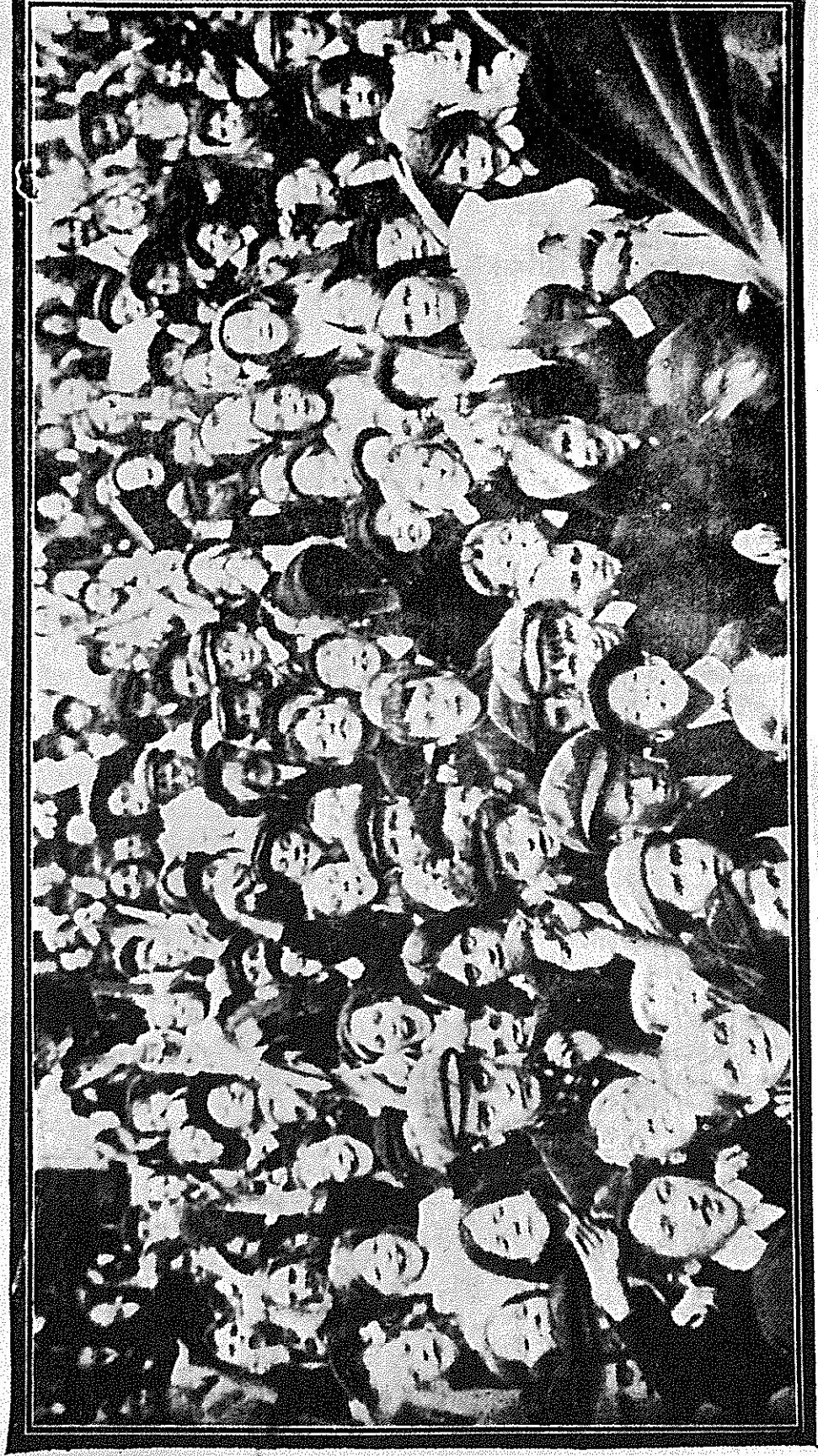
On Tuesday large numbers of schoolboys at various schools in Hull refused to return to their lessons, stating that they were "out on strike for shorter hours and no stick." The picture shows a large crowd of the children in Courteney street.