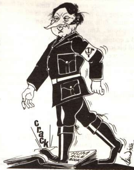
Cartoon from the Nottinghamshire Miner