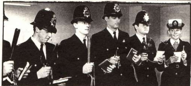
LAW AND ORDER