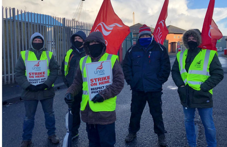
Foyle Port Dockers Strike: Solidarity is Strength!

Magee University in Derry was one of 58 universities across both islands which took industrial action in December as UCU members voted in favour of strike action on pension cuts and on pay & working conditions.