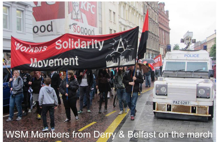
WSM Members from Derry & Belfast on the march

“Each of us expects to remain active in anarchist politics and indeed to often find ourselves working together, including potentially as members of future organisations. We recognise that old habits are hard to