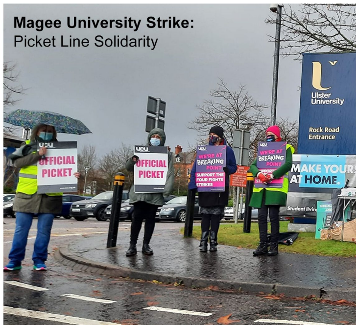
Magee University Strike: Picket Line Solidarity

Over the next number of months workers will once again take industrial action in an effort to fight for better pay and conditions. Talk to your fellow workers about extending solidarity today!