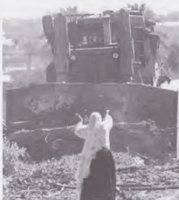
A Palestinian woman challenges Israeli bulldozer in a more contemporary image of direct action