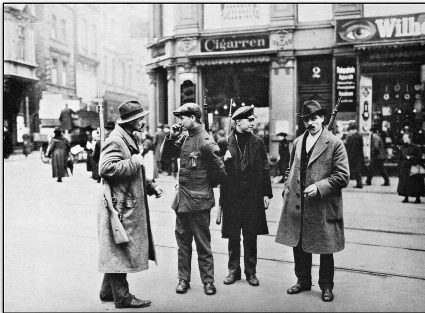
Workers of the Red Ruhr Army patrol in Oberhausen.

In Berlin, the putschists are finished. Banker Kapp has disappeared, general Lüttwitz wants to go home. He negotiates with the conservatives the handover of power to the previous government. The negotiators hope the people would end the general strike when the social-democratic ministers would return. They hope in vain.