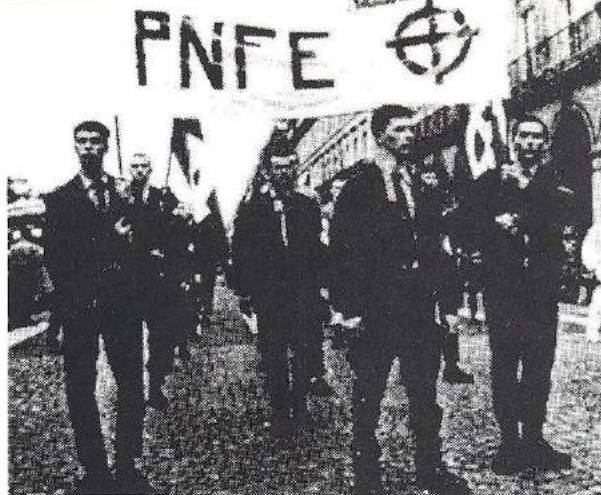
One of the Front National's rivals on the ultra right.

The racist anti-Arab campaign rapidly struck chords in other parts of France too, particularly when Mitterand steered through a law granting amnesty to illegal immigrants in the early eighties. The industrial working class of the northern cities was experiencing a sudden high wave of unemployment as Mitterand's quasi-monetarist policies hit them, and the added threat of cheap North African labour undercutting their wages led to a wholesale abandonment of the Communist Party in its traditional strongholds, most notably the "Red Belt" in the working-class suburbs of Paris, as workers rallied to the racist and protectionist calls of Jean Marie