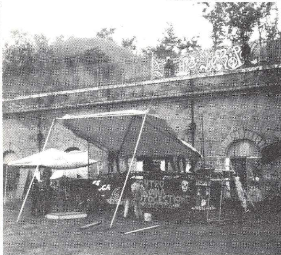
The stage at the Forte Prenestino.

communicating on an international level the importance of this cannot be exaggerated.