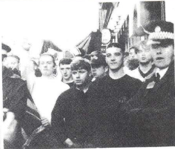
Glasgow's Aryan supremacists with their police guardians.

We have the will to resist fascism in Dublin. What we need now is more people—individuals and groups—to join us in the fight against fascism and to build Dublin AFA.