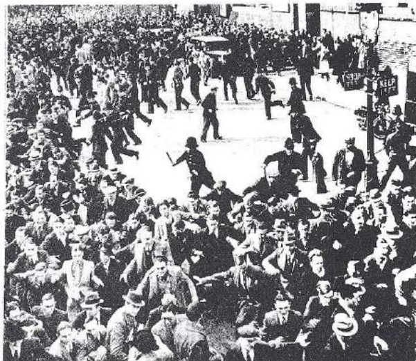
Police waded in to make way for the fascists — to no avail.