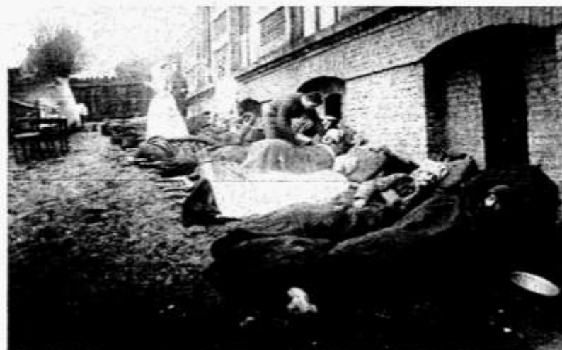
1 Casualties of one of the first German chlorine attacks, April 1915. The victim could take anything up to two days to die, coughing up pint after pint of yellow liquid – hence the basin by the patient's side.

All the while, Churchill continued to pound the Ministry of Supply with threats, instructions, exhortations and advice, normally in the form of 'Action This Day' memoranda. By the end of 1941 he had transformed the situation. The Chiefs of Staff were told on 28 December that Britain could now take offensive action with mustard gas at five hours' notice. 22 Four Blenheim and three Wellington squadrons were trained in the use of aerial spray. 15 per cent of the British bomber force could be employed in chemical warfare. By the spring of 1942 – thanks chiefly to the extraordinary time and trouble Churchill had gone to – Britain had almost 20,000 tons of poison gas.