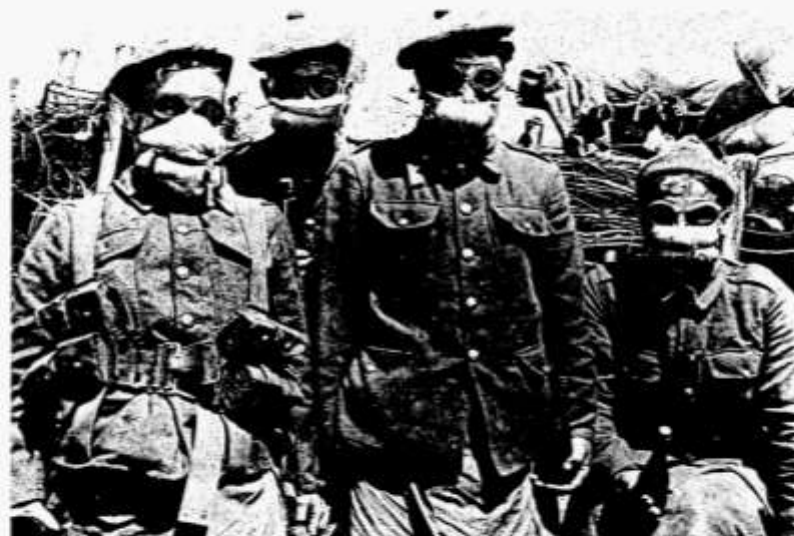
2 The first British respirators, May 1915. Each man carried a bottle of soda solution with which he was supposed to moisten the flannel. The masks were little protection: on 24 May, 3,500 men were gassed in a single four-hour attack.