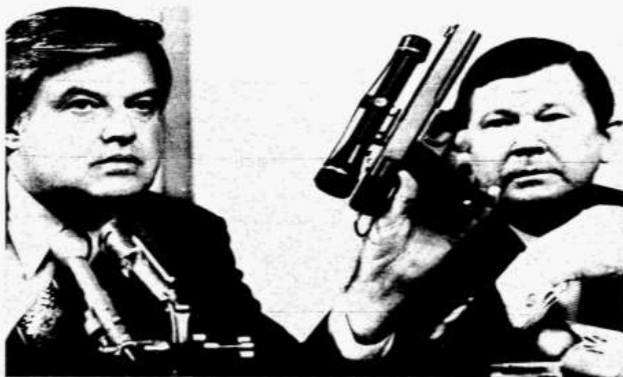
29 A CIA poison dart gun produced during 1975 Senate hearings into why the agency had disobeyed presidential orders to destroy stocks of biological weapons.