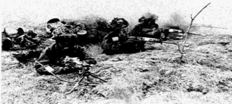
30 British soldiers training against gas attack, 1980. The new gas training range at Porton Down was evidence of mounting alarm at the prospect of chemical warfare in Europe.