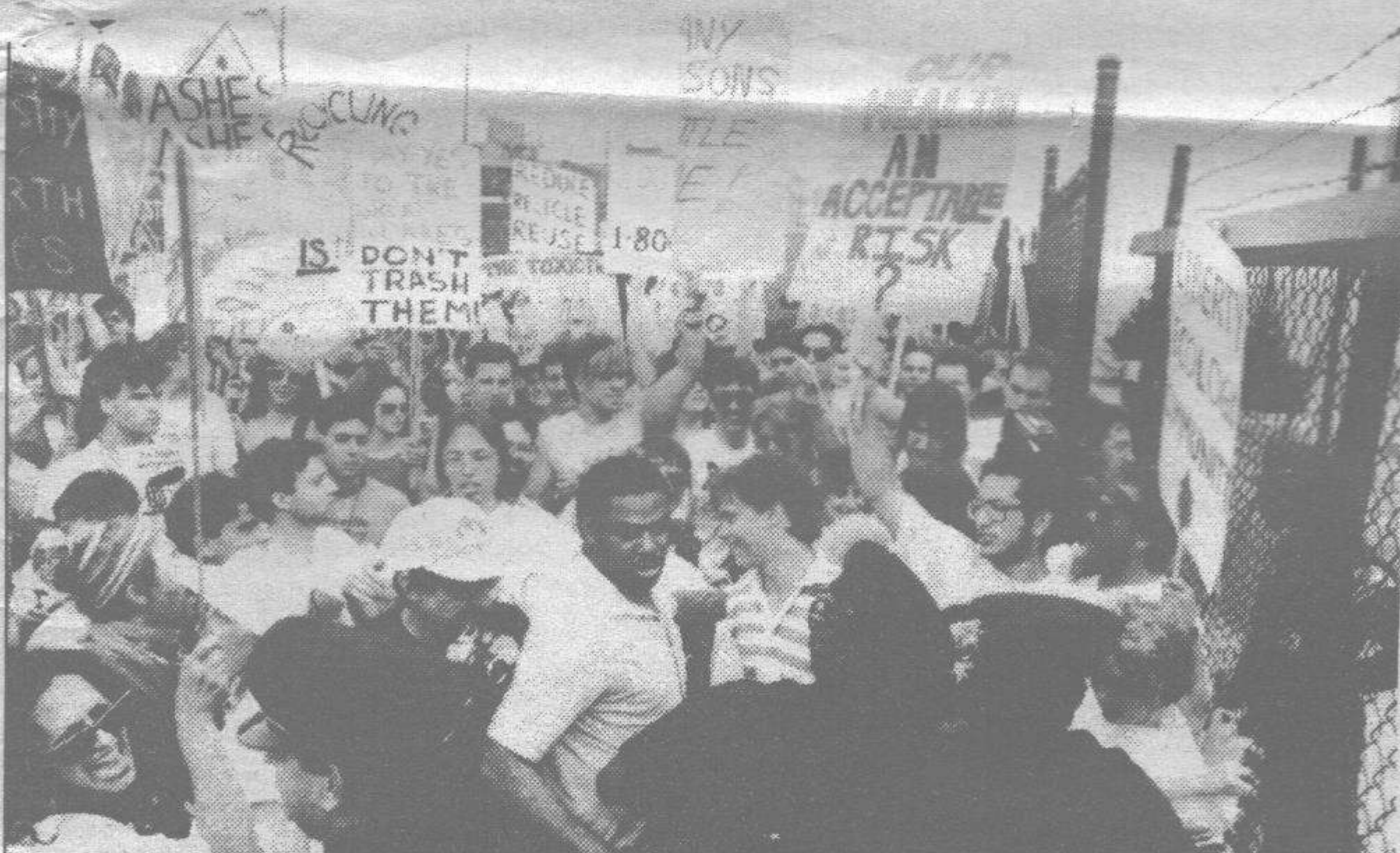
Demonstrators blockade the gates of Detroit's new killer incinerator on 3 June to demand its closure. Info: Fifth Estate