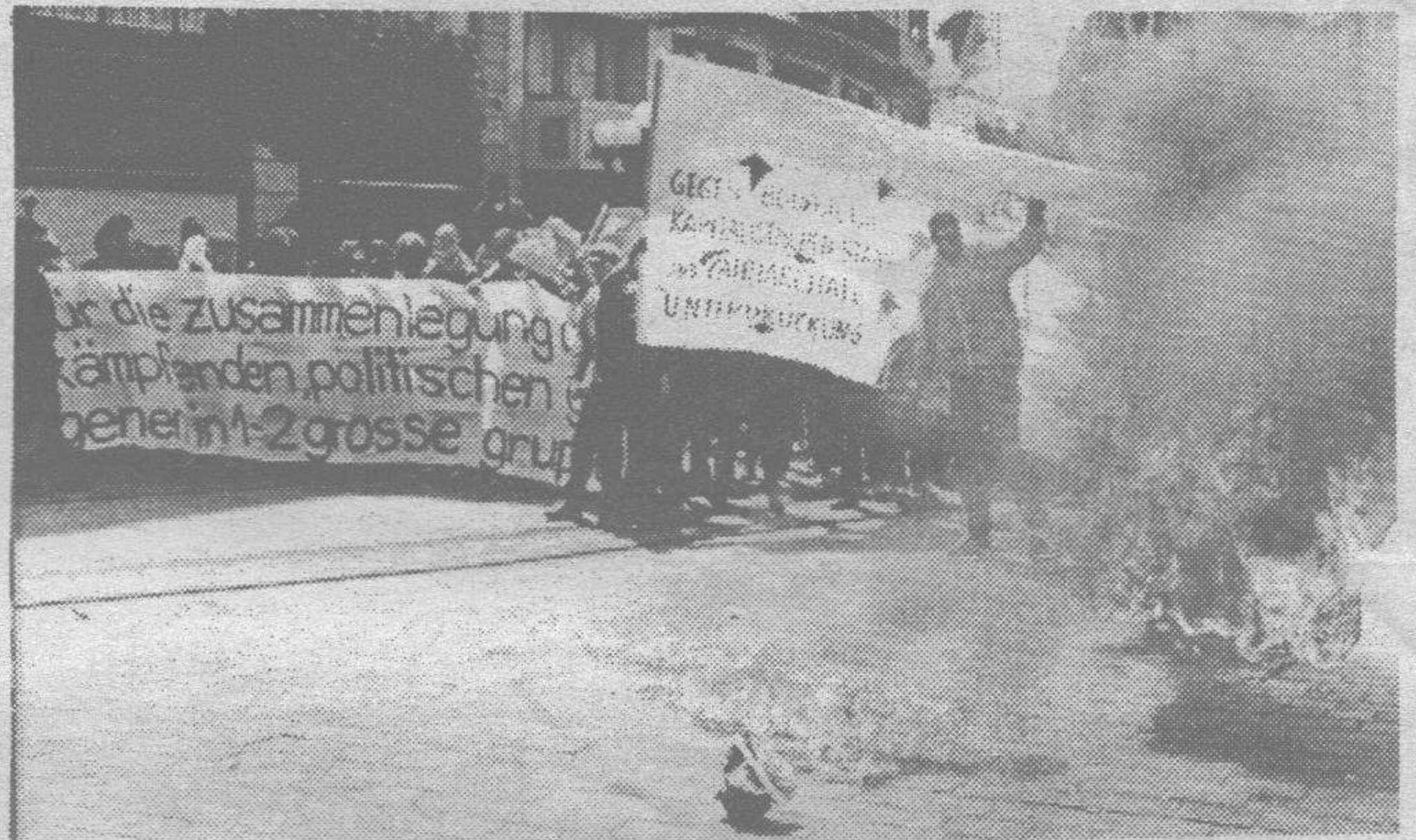
Demonstrators burn the Swiss and Zurich flags in the Paradeplatz, "place of the banks".