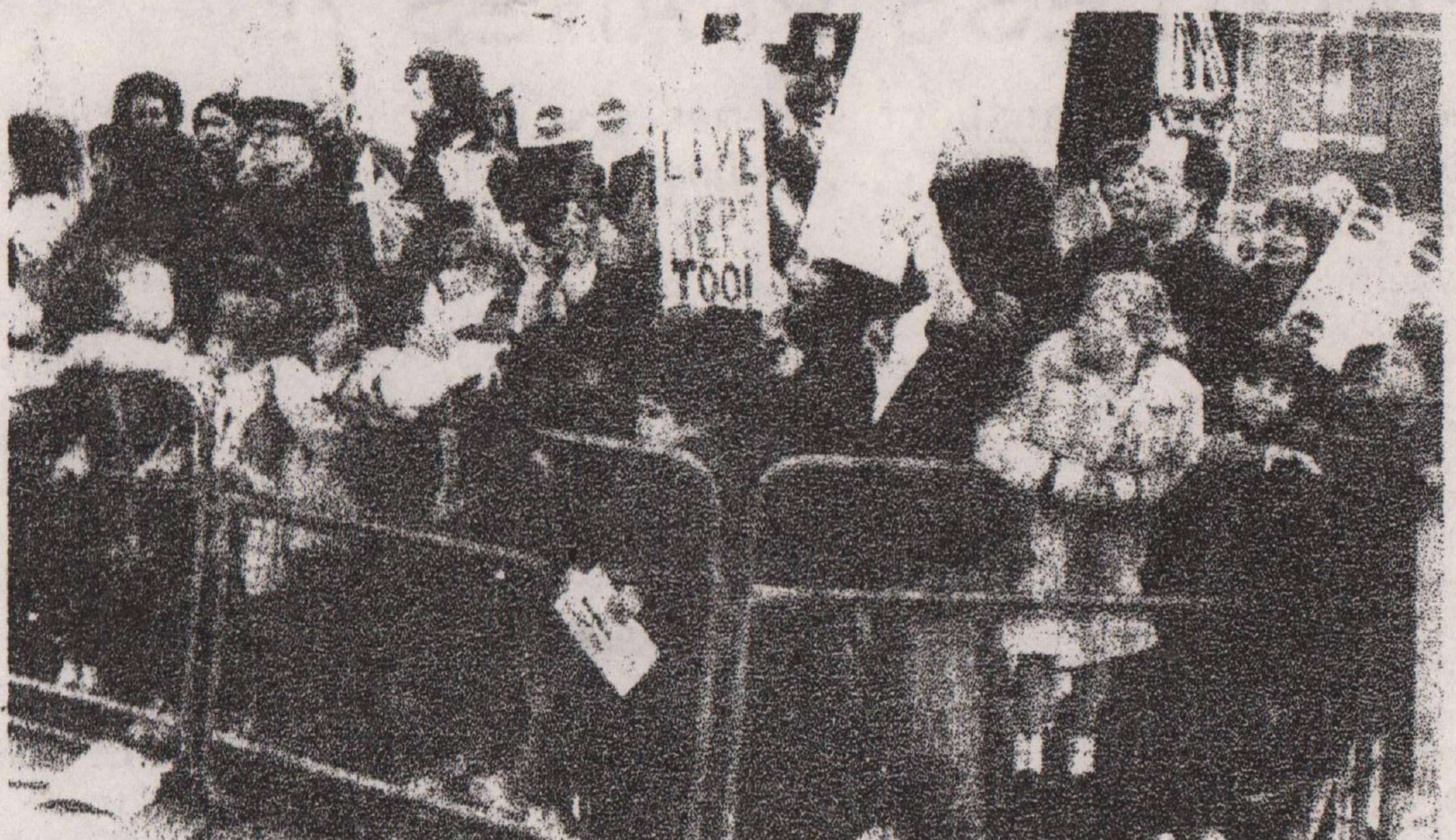
Waterlow protesters wait for the Prince.

whole block of 40 perfectly good flats. The Liberal council says this is to improve the environment "for the benefit of all the people who stay on the estate"; in other words, so the new wealthy residents can have a nice view.