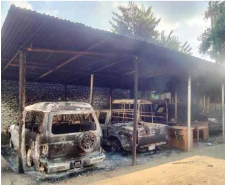
Burnt up vehicles of CHT Regional Council