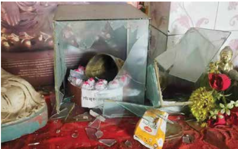
Vandalised and looted donation boxes at Moitree Bihar

Following this, the Bengali settlers made attack and arson at the houses of Jumma people. The Bengali settlers also attacked, vandalized and torched Jumma-doctors'-run Cevron and Medinet Clinic, Jumma-people-run shops in Bijan Sarani area and District Office of the PCJSS. On the other end, they attacked, vandalized and looted the traditional Maitree Bihar Buddhist temple and pelted stones at Tabalchhari Ananda Bihar Buddhist Temple in Rangamati. The settlers broke the gate of Kathaltali Maitree Bihar and broke the Buddha statues, vandalized and broke and looted the donation box. They looted and taken away 7 numbers of donation boxes, cash amount of BDT 90,00,000 monthly subscription, 10 numbers of metallic Buddha images and laptops. They also pelt stones at the Jumma dwelling houses in Hospital and T&T area.