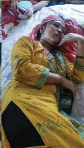
Casualties of Dighinala, Khagrachari and Rangamati incidents