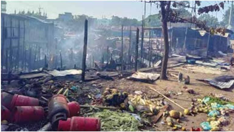
Shops and houses of Jumma people were burnt to ashes at Dighinala Station Bazae

just to worsen the CHT situation. During the protest, the PCP demanded to bring the persons involved in the 2-day incidents to the trial immediately and implement the CHT Accord to its full and in appropriate manner.