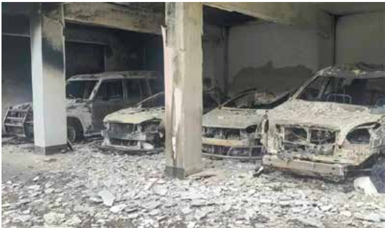
Burnt up vehicles of CHT Regional Council

Towards 11:00 pm, an army vehicle from the Cantonment was on the way to Swanirbhar area. The youth students coming from Gachban and Perachara blocked the vehicle on the road. They got involved in hot exchanges with the army. The youth students used catapult against the army. At certain stage, the army opened fire at them. At this, 20 Jumma