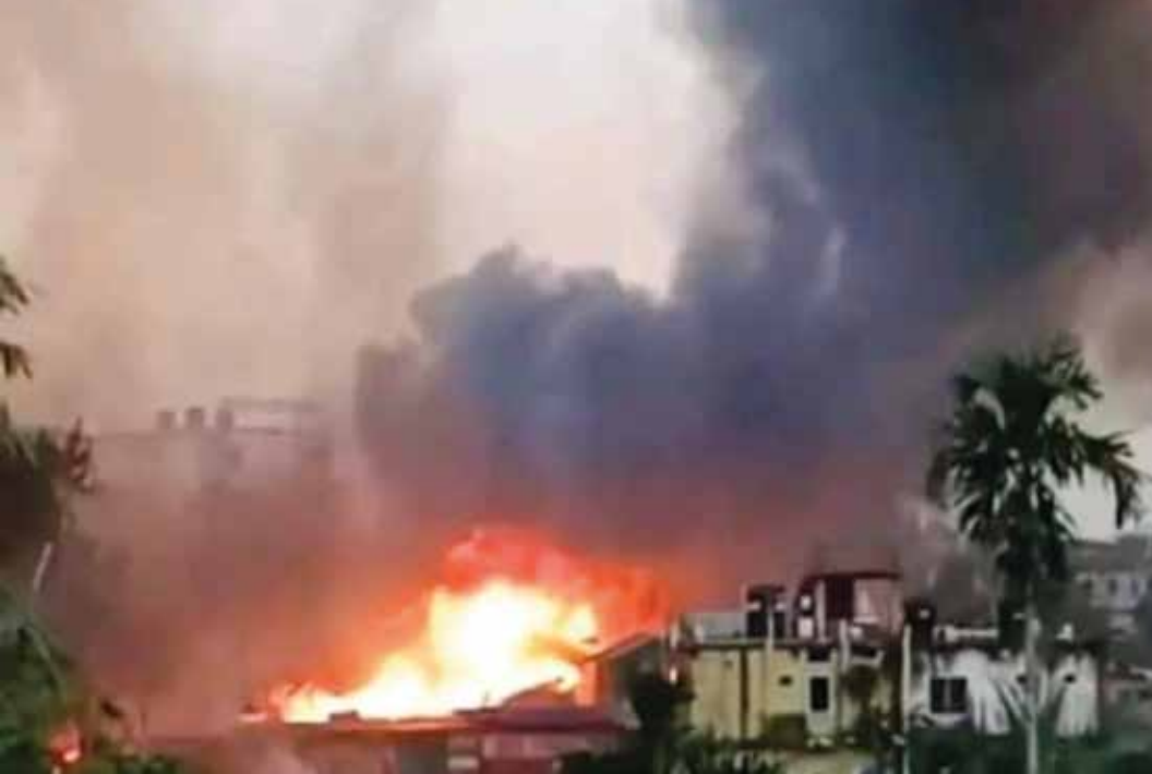
Shops and houses of Jumma people were burnt to ashes at Dighinala Station Bazaar

Khagrachari town. But at certain phase, the Bengali settlers had to move back in the face of organized resistance of the Jumma people.