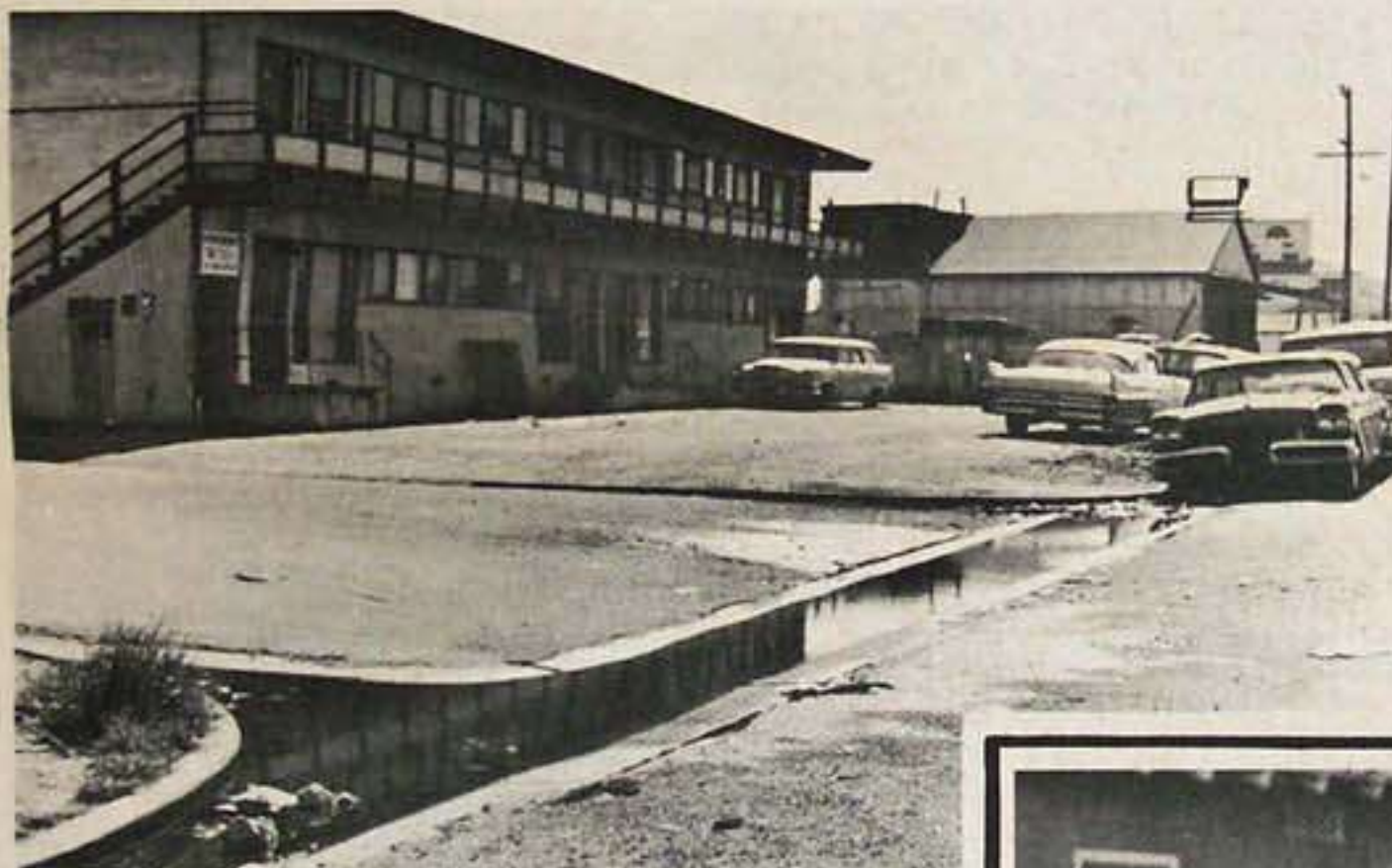
THIS IS WHY NORTH RICHMOND IS BLACK PANTHER TERRITORY. GUNS IN THE HANDS OF BLACK MEN CAN CHANGE ALL THIS. GUNS. GUNS.

The heirs of Malcolm now stand millions strong on their corner of the triangle, facing the racist dog oppressor and the soulless endorsed spokesmen. The heirs of Malcolm have picked up the gun. And, taking first things first, are moving to expose the endorsed spokesmen for the black masses to see them for what they are and always have been. The choice offered by the heirs of Malcolm to the endorsed spokesmen is to repudiate the oppressor and crawl back to their people and earn a speedy reprieve or face a merciless, speedy and most timely execution for treason and being too wrong for too long.