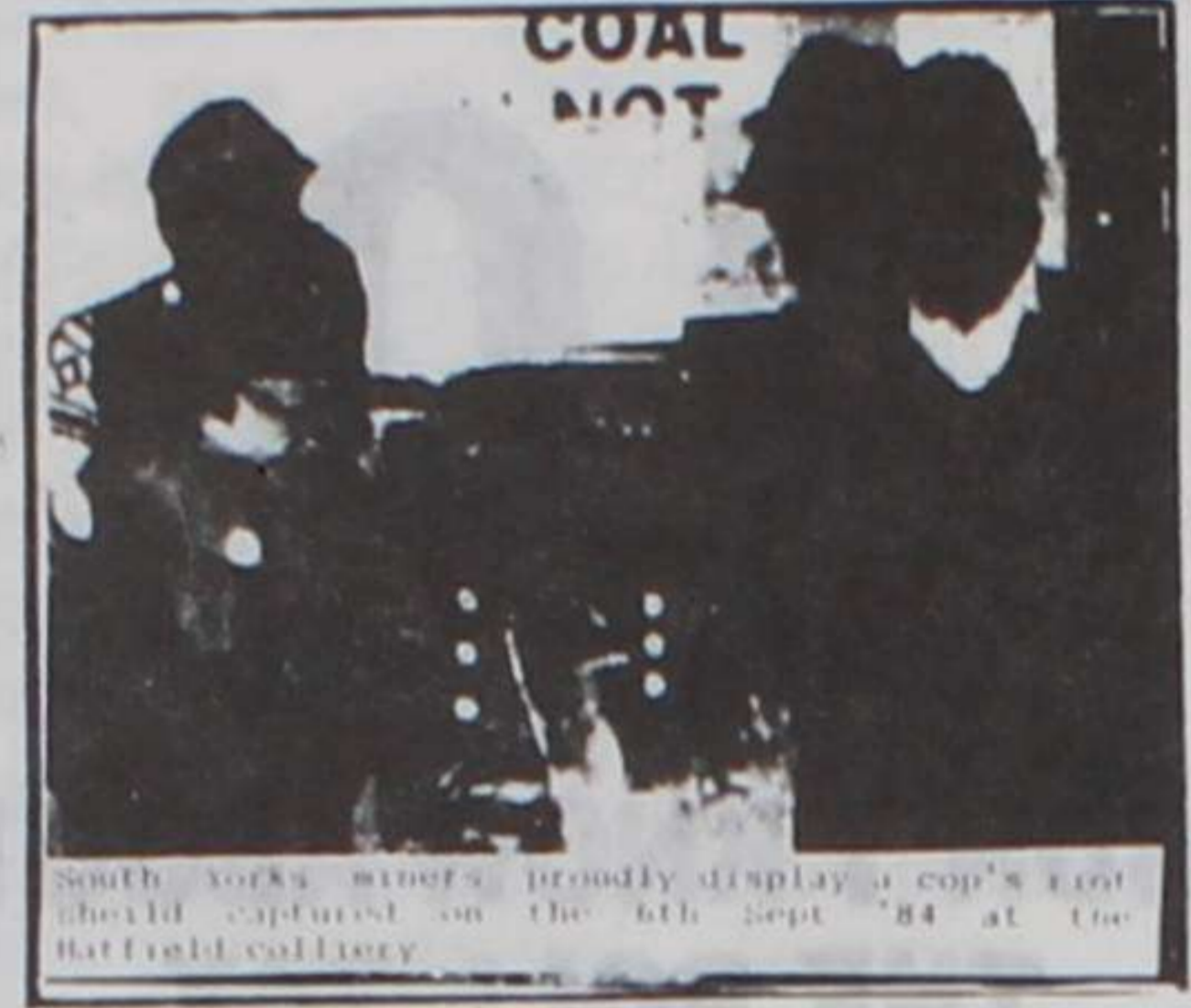
South Yorks miners proudly display a cop's baton which captured on the 6th Sept '84 at the pithead colliery.

"Yeh, you were ready for us at Orgreave, you beat us there. You learnt lessons but so have we. Next time it'll be different" SOUTH YORKS MINER TO POLICE. WAPPING 1986