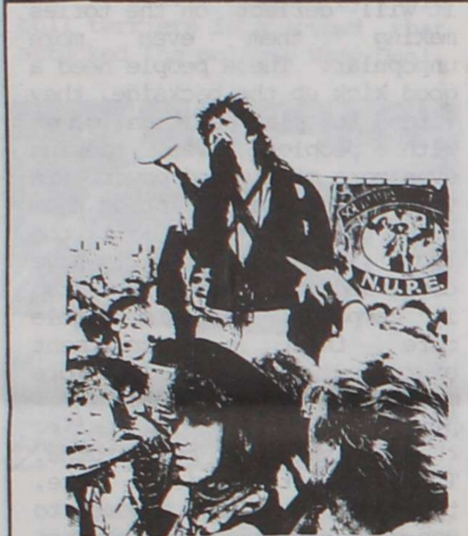
Trying to be heard... Speakers at the health service rally in Hyde Park on Saturday were shouted down by fascist thugs that no one from the health service had been asked to speak.

"The health service is safe in our hands" GUESS WHO?