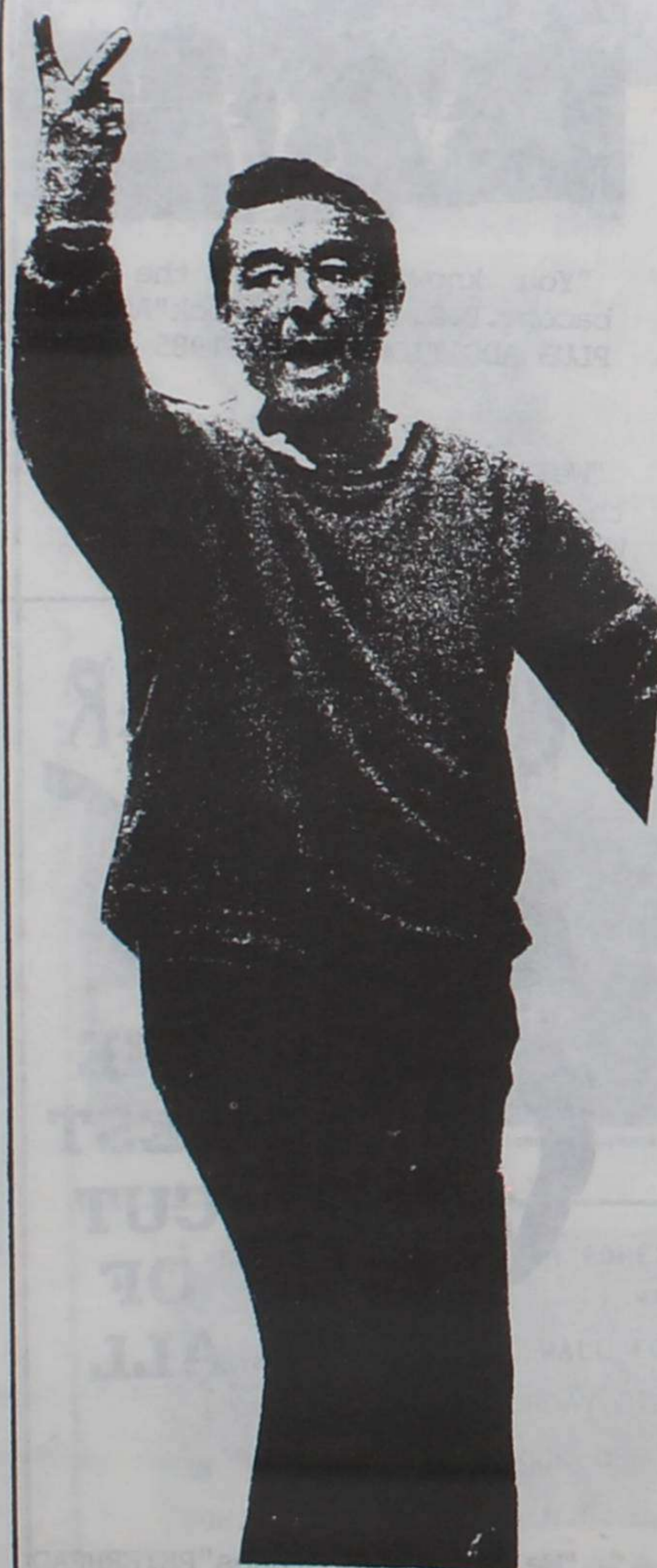
Cloughie says hello to all our readers

Brian Clough hit the headlines recently with his single handed attempt to stop a pitch invasion at the City Ground in Nottingham. He told the press after the incident that he was just giving a few troublemakers "clips round the ear". I'll tell you what I wouldn't want to get a clip from Brian, I don't fancy a trip to the dentists. Who does he think he is? After all there was no trouble going on, Forest had just won 5-2 and reached the semi finals of the Littlewoods Cup and the traditional celebrations were taking place.