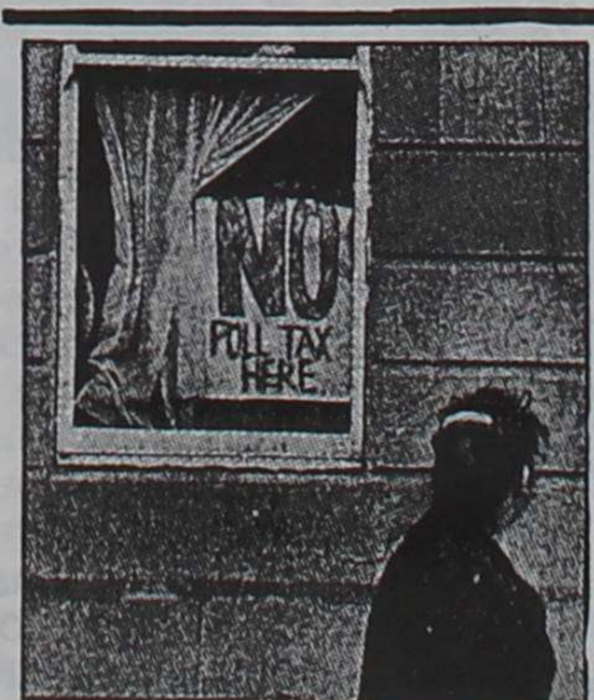
Defiance in Glasgow