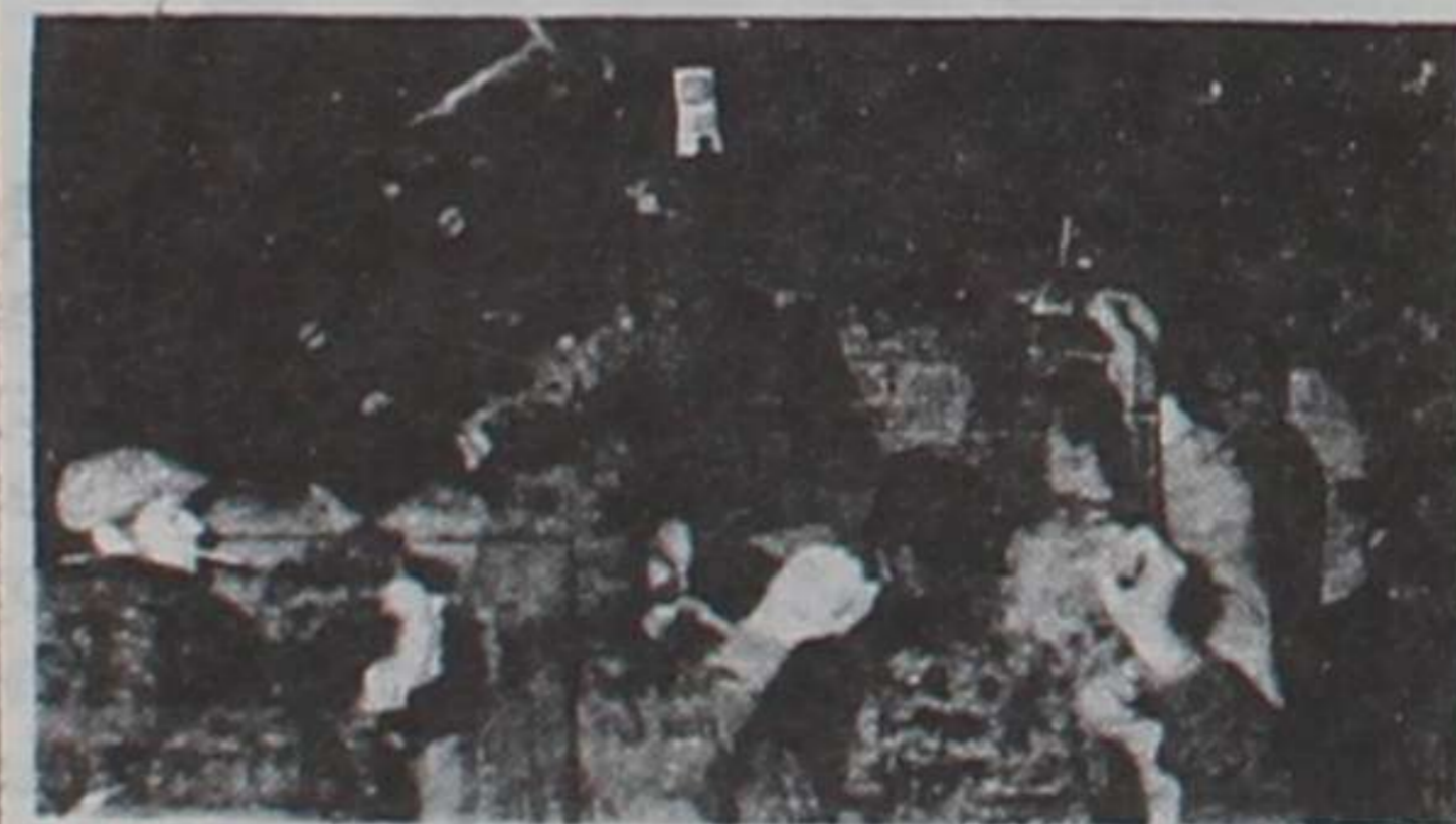
FURY: Protesters overturn a lorry at the height of Saturday's violence.