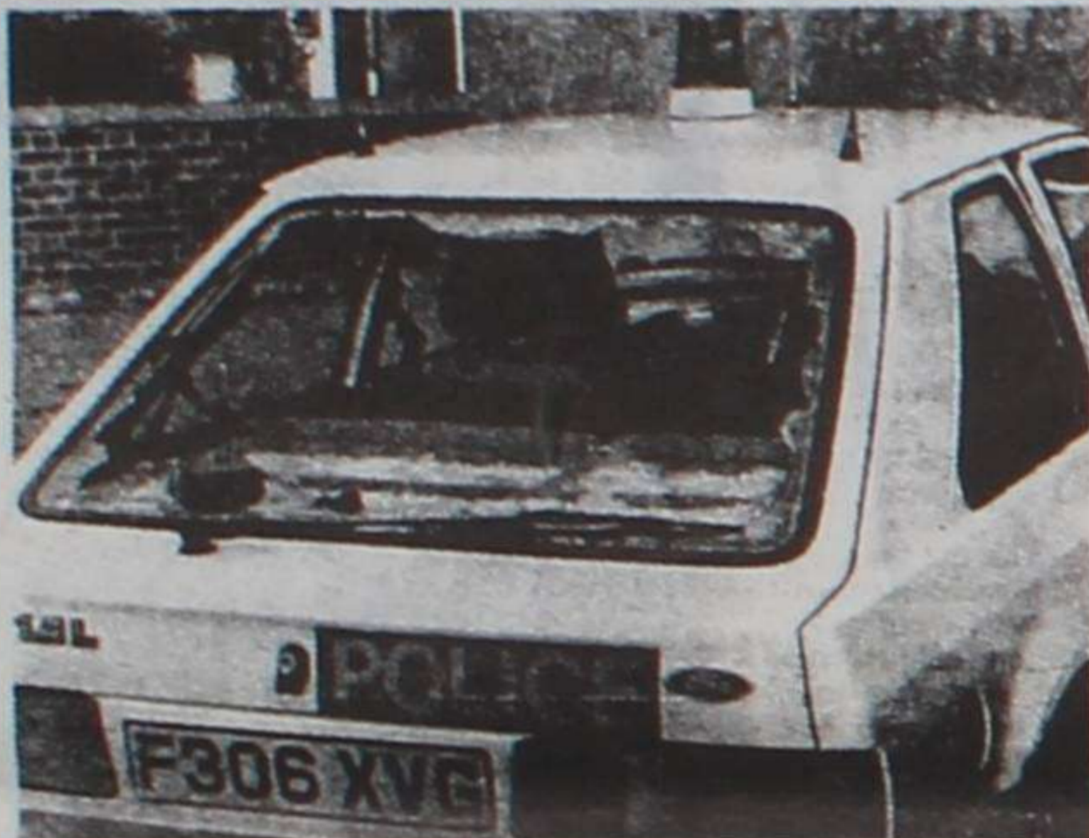
Missile... a brick lies behind the smashed window of a Dereham police car

O.B.E.'s go to Portsmouth (3 police hurt) and Tredegar, Gwent (6 cops injured) and a very special medal for services to Animals goes to the people of Chudleigh in Devon where 3 cops were decked and a police dog was badly savaged by 2 pit bull terriers in a crowd that attacked the police. Nice One!