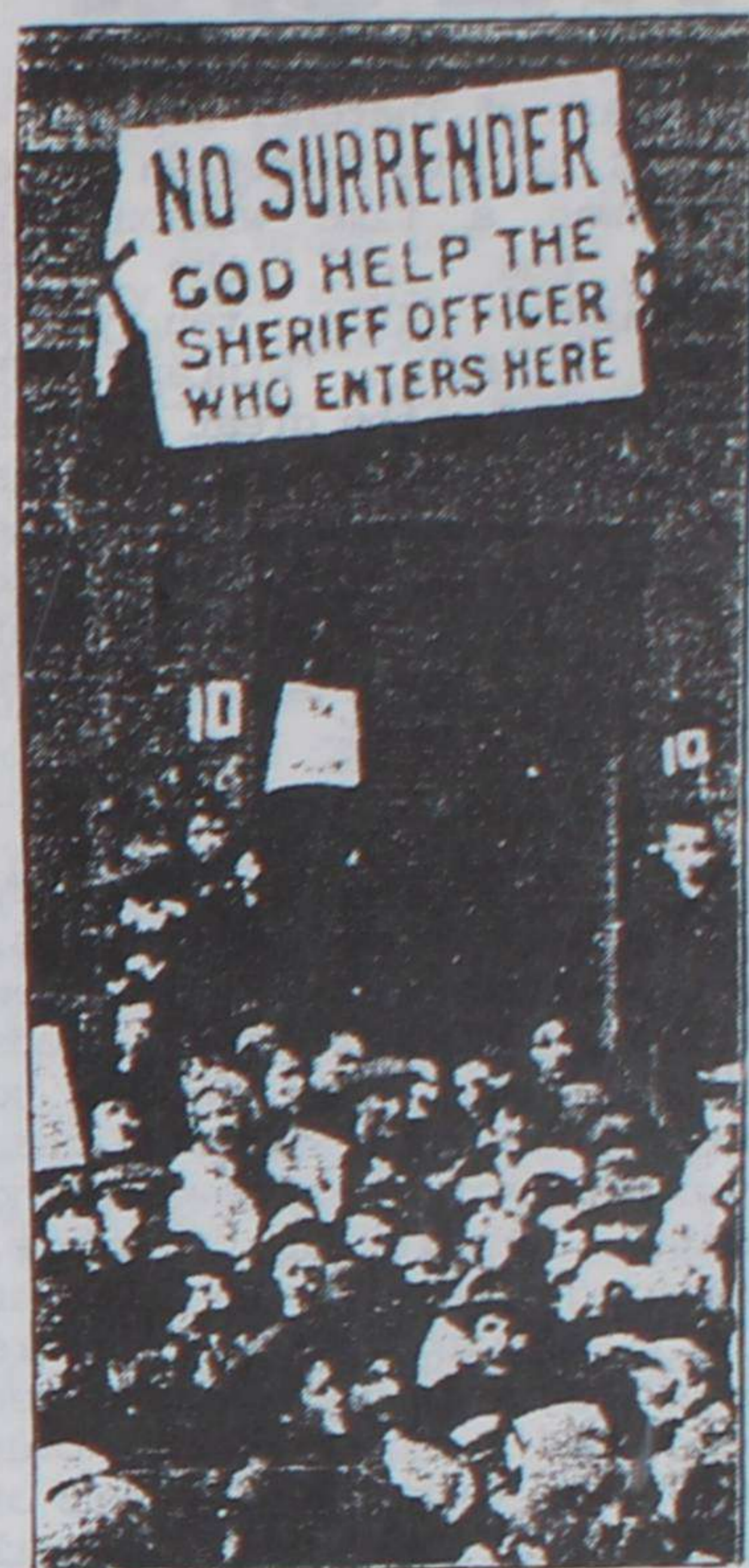
• Beat the Bailiffs: the way your granny did!

We dont want to give the impression that nothing can or is being done about resisting the Poll Tax. In Scotland where the tax is being brought in first lots is being done to try and stop even the registration. In one town people organised street collections of registration forms and returned them all unfilled to the registration office. In North Pollok, local youths dumped forms in a fire after snatching them from fleeing canvassers. One registration officer was waylaid on a Glasgow estate and warned "NEXT TIME, COME BACK IN A TANK!" Community resistance groups are springing up all over Scotland, giving an inspiring lead to those south of the border, Scots are coming together in ever increasing numbers to loudly shout "I'M NO PAYING!".