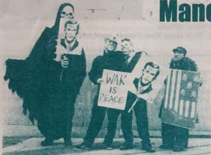
Disguised Mancunians on the Liverpool Anti-War March

Actions against the war have been breaking out all over Manchester. The Army Recruitment Office, BP and Menwith Hill are a selection of the targets hit by local anti-war activists. More and more graffiti and artwork has sprung up in recent weeks, making the links between oil and war, 'No War' is plastered on the side of the barracks in Whalley Range, and over army recruitment ads. Manchester folk travelled to Liverpool (pictured) and Bradford anti-war rallies on the global day of action on January 18th. Over fifty people at a recent forum, attended workshops on Direct Action, What next in Manchester, Subvertising, Palestine, and banner-making. Leafleting is happening in local areas