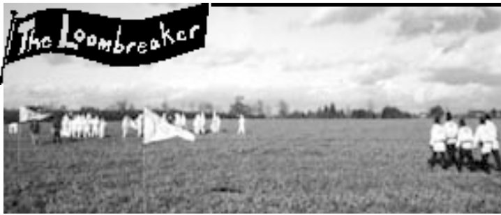
People trashing the GM Crop near Stratford