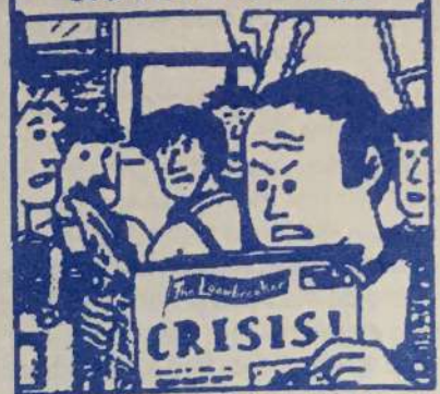
The Loombreakers were Lancashire weavers who, in 1826, smashed the machines that were destroying their livelihoods and communities. The Loombreaker is ©ntcopyright.