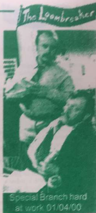
Special Branch hard at work 01/04/00

Elsewhere opposition to the Terrorism Bill is gathering momentum. In Morpeth,