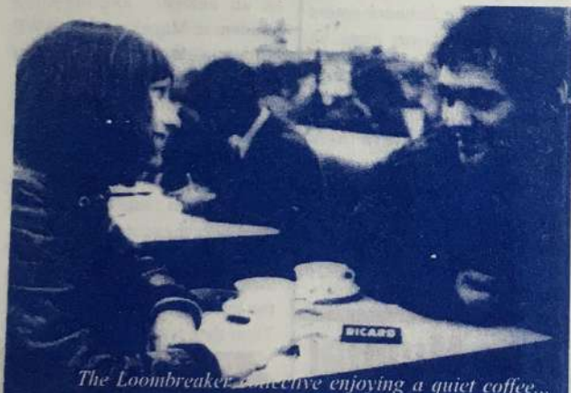
The Loombreaker collective enjoying a quiet coffee...

The Loombreaker social went well, most of the feedback was positive, The main outcome was that we have bowed to public pressure and are introducing a "letters page" from January's Loombreaker. This provides a space for your criticisms and comments and will also allow debate and discussion about issues raised in The Loombreaker.