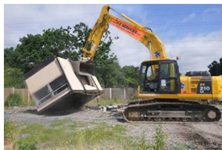
Traveller eviction at Hovefields, Essex, June 29th, 2010

Gypsies and those living nomadic and itinerant lives have always suffered from racism and