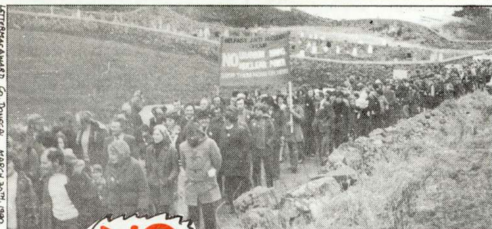
LETTERMACAWARD, CO. DONEGAL MARCH 30TH, 1980.