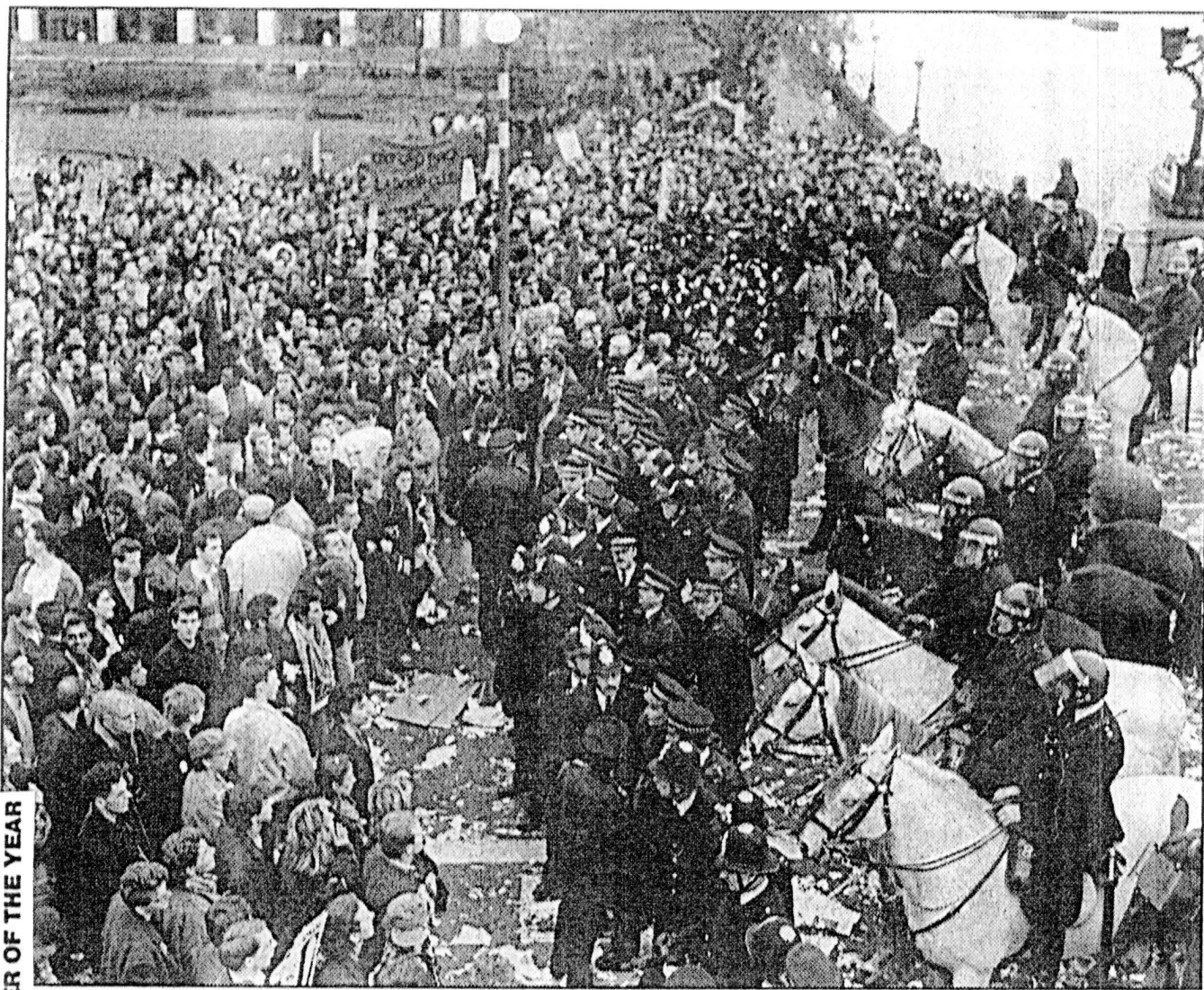
Police confront students on the march against student loans at Westminster Bridge on November 24, 1988