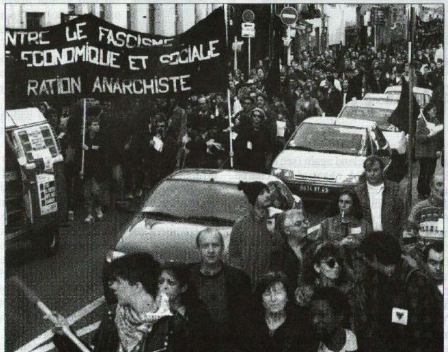
3000 marched through Lyon behind the banner of the anarchist federation (FA), on the 22nd Feb, to show their contempt for fascist violence. The anarchist bookshop 'La Plume Noire' had been burnt out in the early hours of Feb 16th by fascists. Among those showing solidarity with the FA were the CNT, rank and file unionists and 3 leftist mayors! La Plume Noire 2 is now open.